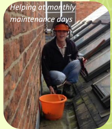
Helping at monthly maintenance days