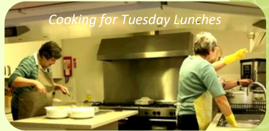
Cooking for Tuesday Lunches

On the back page of this booklet, is a form for you to let us know which areas you'd like to get involved in. Please prayerfully consider into which areas God is calling you to help.